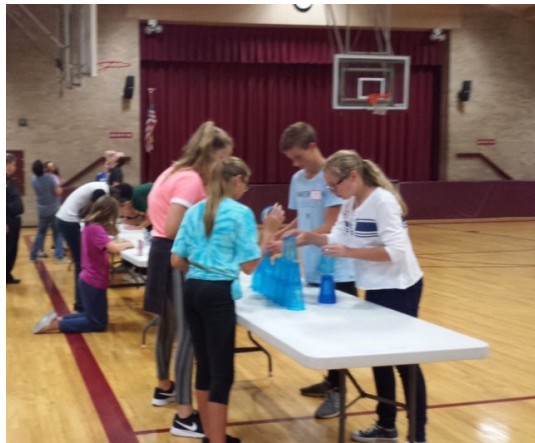
Games being played by the Youth Group.